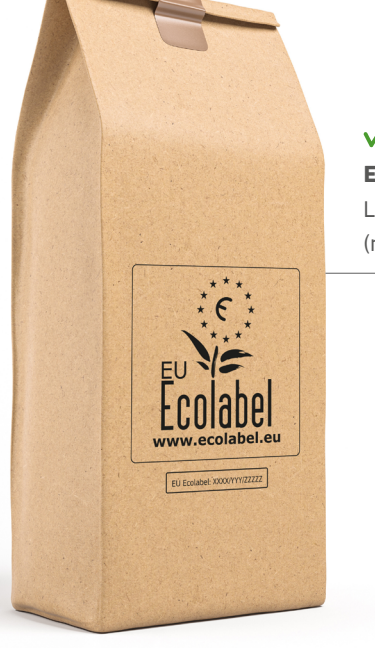
✓ Correct: Example 1: License number directly above or below logo (most common)

Whenever the EU Ecolabel logo is presented <sup>2</sup>, the relevant license number must appear (preferably near the logo). The following examples illustrate acceptable placement of the license number in relation to the EU Ecolabel logo: