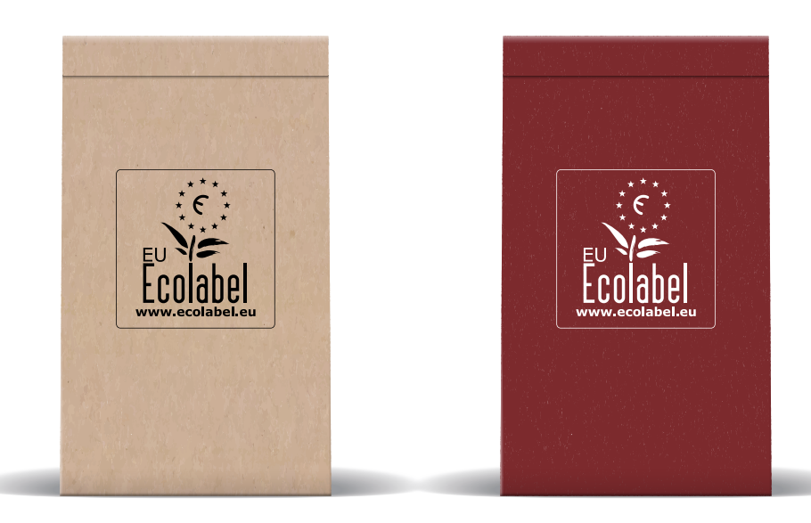
Black or white on a coloured background (not patterned).